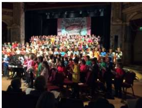
Rossett Acre children at The Royal Hall