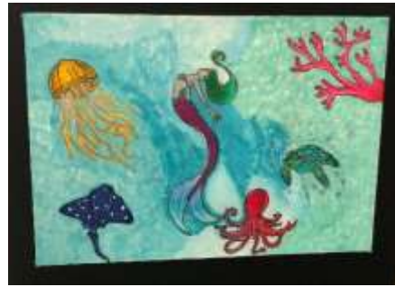
Alice's wonderful artwork – highly commended