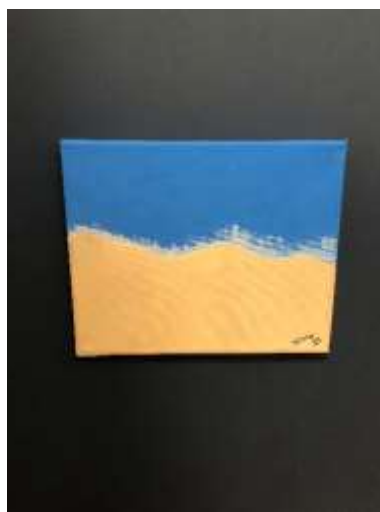
Varsha's wonderful artwork – winner of local heat