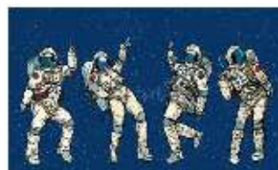
Year 1 children enjoyed developing their Space themed Dance.