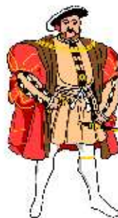
Year 3 and 5 threw themselves into their Tudor Dance!

The after-school Football and Netball clubs have been a real success this term, with children showing excellent progress and development as they have significantly improved their football and netball skills as well as their fitness throughout the sessions; this alongside working together as a team to build confidence. Well done to you all!