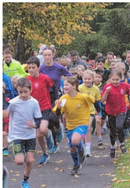
Rossett Acre Primary School takes over the Harrogate Junior Parkrun

Best advice.. get some rest over half term. Oh! And if you can, please have a clear out and donate some bits and bobs for our Jumble Sale!