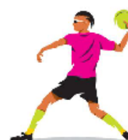
Dodgeball has been a popular activity at KS1 Afterschool club.