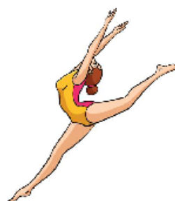
Year 2 enjoyed developing their space themed dance!

Well done to all taking part, It has been amazing to see the commitment of both children and staff!