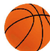
Year 6 loved applying their Basketball skills in games.