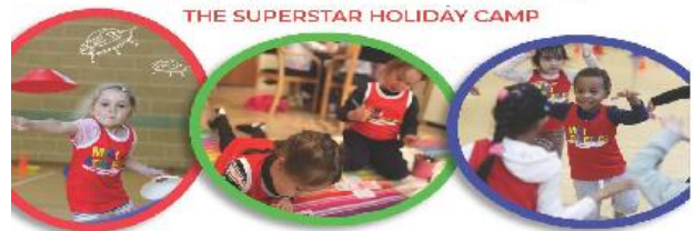
THE SUPERSTAR HOLIDAY CAMP

All children will receive a healthy breakfast and packed lunch. To book your place go to www.miniathletics.com/holiday-camps