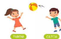
Throwing and Catching Skills used In Invasion Games

Afterschool Club: This terms club has focused on Invasion Games. Two weeks of Benchball, Dodgeball and Protect the Hut have developed the children throwing and catching as well as tactics and strategy.