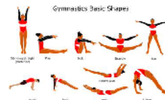
Some of the basic shapes Y3 children have been working on In Gymnastics