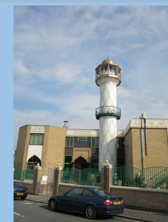
Visits in RE include trips to local places of worship such as Churches and Mosques as well as visitors to school.