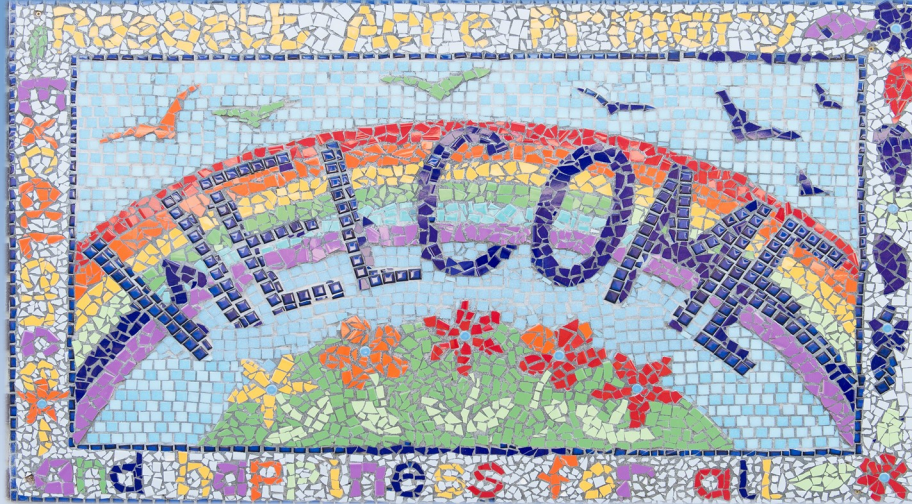
Mosaic located at our main entrance, designed and made with some of our children by the charity Craft Aid International.