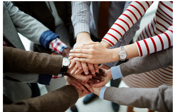
Could your business support our school?