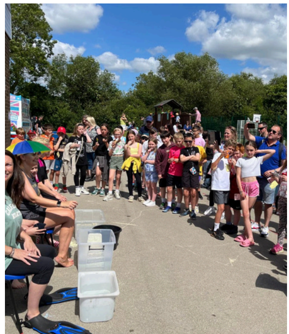
Flashback to our teacher soak