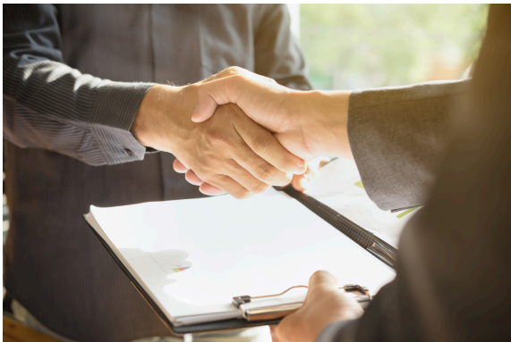
Creating business partnerships